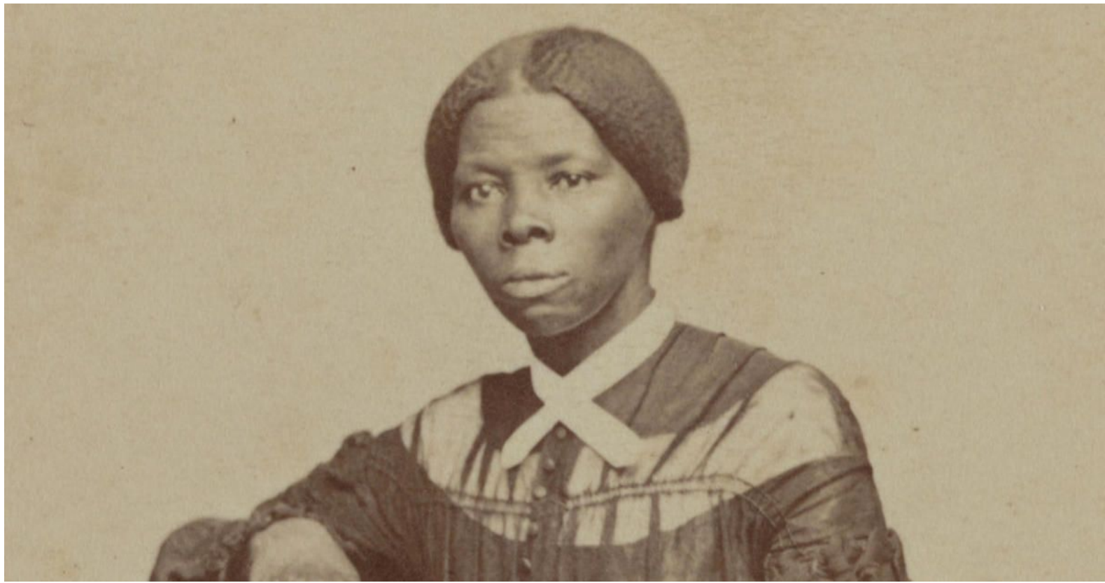
Harriet Tubman, 1868